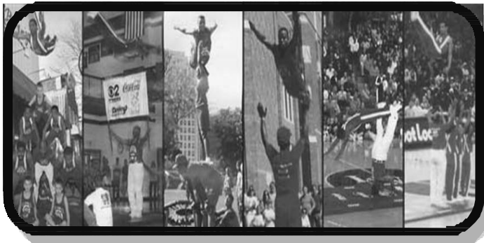
JESSE WHITE TUMBLERS